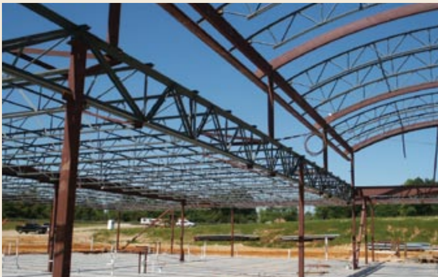
Open web steel joists can be adapted to a variety of geometric configurations.

Most structural steel framing members are designed and specified by the project's engineer of record, and solid web beams and columns are typically noted on the structural drawings. The steel fabricator and detailer develop material cut sheets and produce shop drawings directly from these drawings, while the steel joist manufacturer develops its own erection drawings and bills of material for the joists, joist girders, and bridging prior to final design and fabrication. In addition to the physical dimensions required to fabricate the joists and girders, the joist manufacturer must acquire all of the specific loading information in order to complete the designs. Unfortunately, much of the information required for special design requirements for the joists and joist